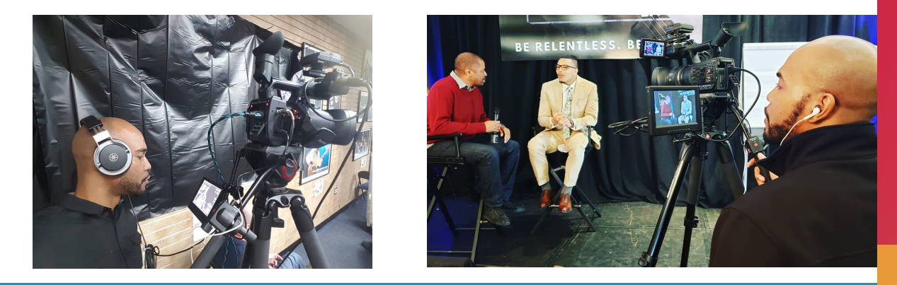
Learn How You Can Support Local Artists and Arts Organizations!