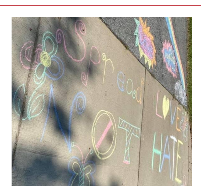
#BowieSpeaks Neighborhood Chalk Art Project

Prince George's Arts and Humanities Council recently co-sponsored the #BowieSpeaks neighborhood chalk art project. Using chalk provided by PGAHC, Bowie residents were encouraged to have fun with their families and engage in conversations about ending racism and discrimination, celebrating diversity and coming together as a community.