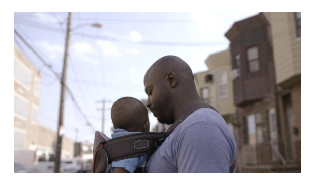
What's in a Name?