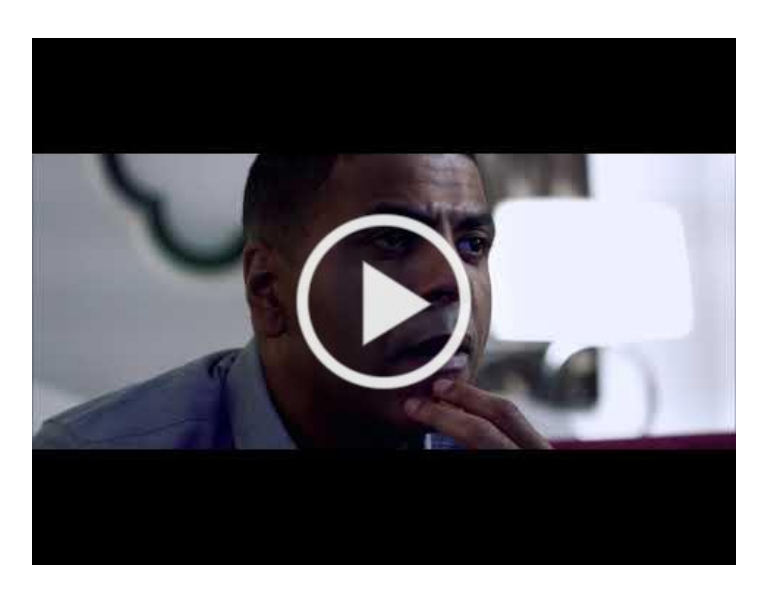
Click here to learn more about the Prince George's Film Office

(Click the image below to view the trailer for Jackson's film, "Unnarmed Man")