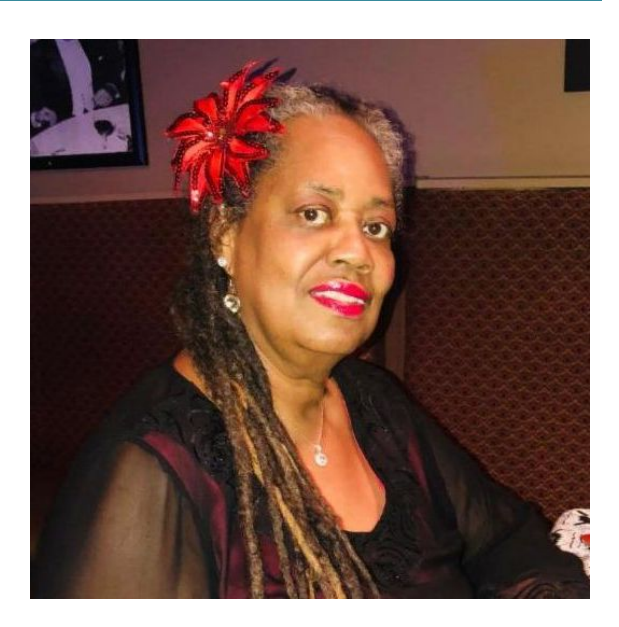
May Poet Laureate Reading and Open Mic: Springtime Memories

The Prince George's County Office of the Poet Laureate partnered with Creative Suitland on Saturday, May 25th, to present "Springtime Memories: A Poetry Affair". The free family-friendly afternoon affair was the 5th in a series of 9 arts-based events being presented throughout the county during 2019 to engage Prince Georgians in poetry as well as cultural and literary expression. 'Springtime Memories' featured poetry by Prince George's Poet