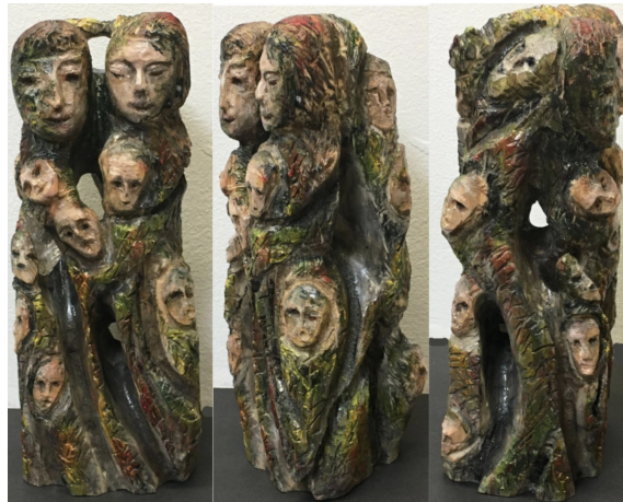
'Wood Carving' Artist: D. Mychajluk

We've also received art pieces inspired by the times: