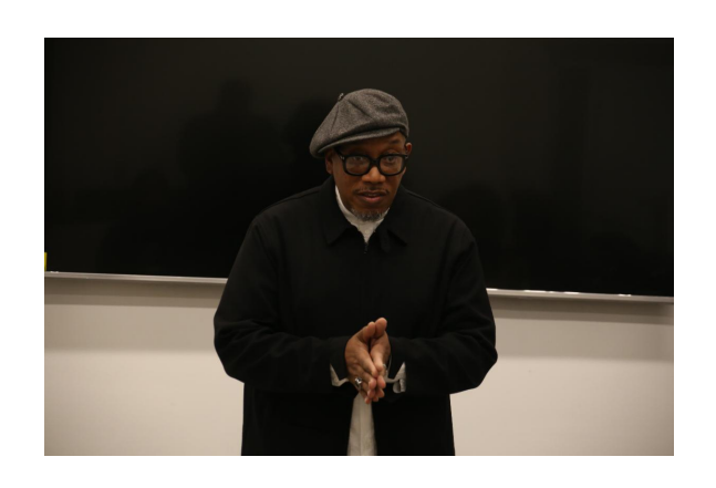
DPARK3311 Hosts Men's Tailoring