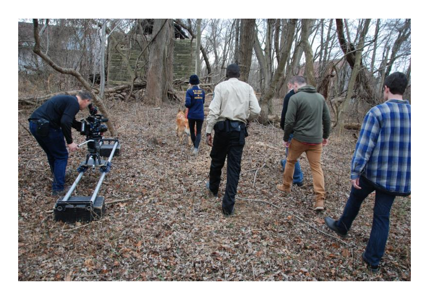
Click here to learn more about the Prince George's Film Office

Watkins Regional Park is located at 301 Watkins Park Drive, Upper Marlboro, MD