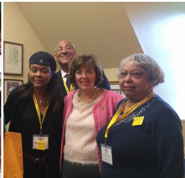
Maryland Arts Day (Annapolis, MD)