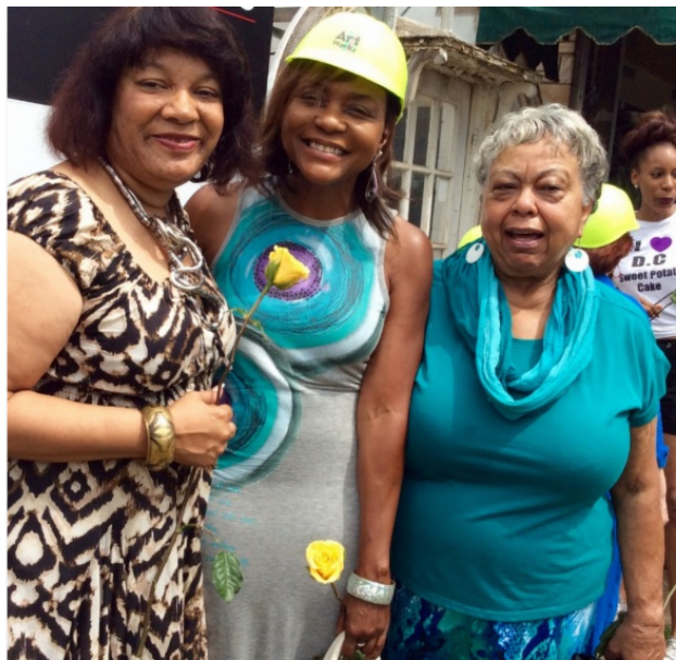
ArtWorks Groundbreaking (Hyattsville, MD)