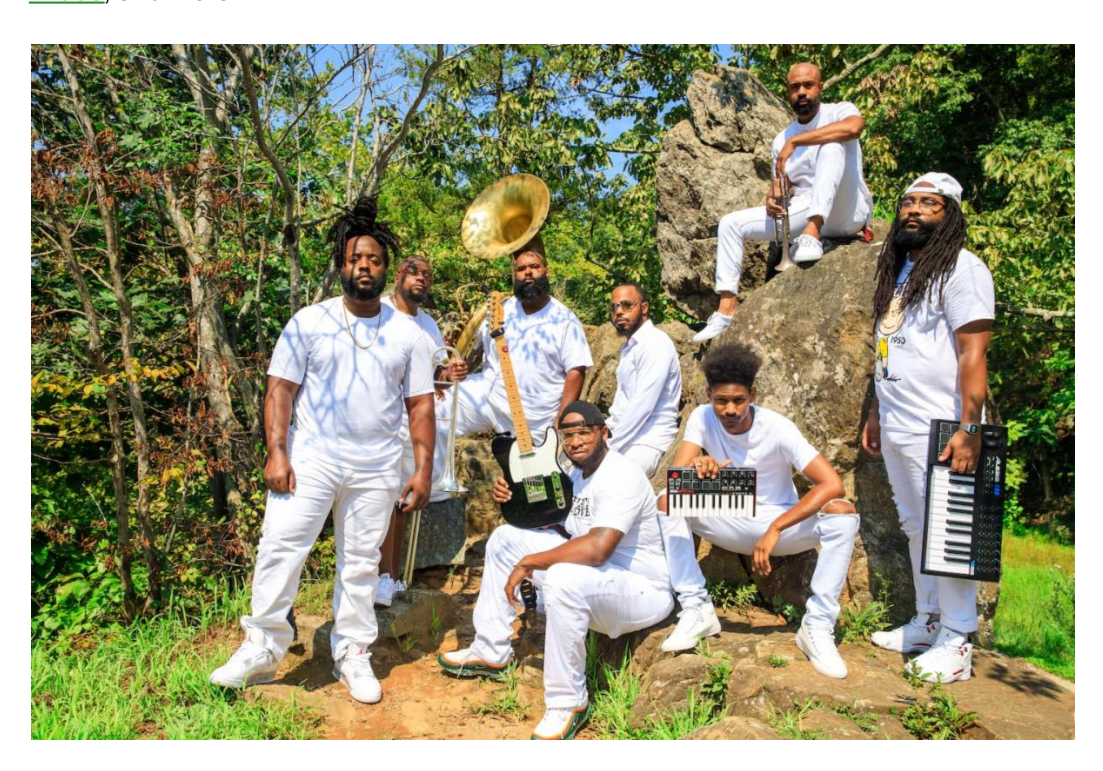
Pictured: Dupont Brass